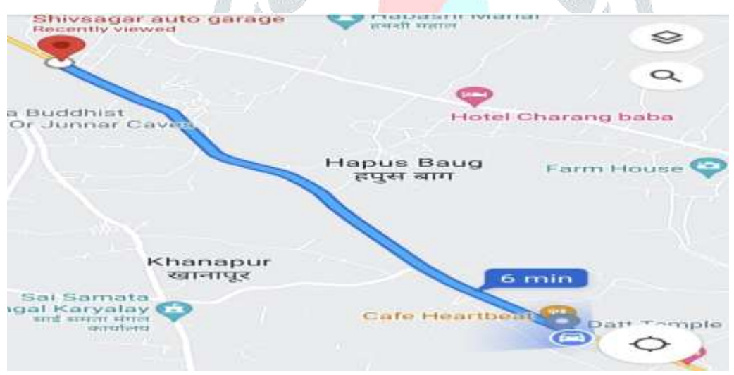
Fig 6.1- Finding Best Route in Google Map

Dijkstra's Algorithm: Dijkstra's algorithm is used to find the shortest path tree from a single source node, by building a set of nodes that have minimum distance from the source. In this application, as there are several routes available to reach to a particular destination the following algorithm will be used to find the shortest path or the best route between the destination to visit from your current location on a Google Map.