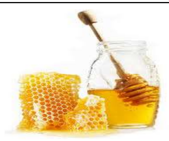
Fig 9:- Honey