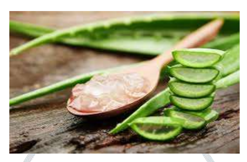
Fig 4:- Alove vera Extract

The definitions of "aloe Vera" and "vera" are dissimilar. Aloe denotes a bright, acrid material, while vera denotes the truth. Aloe vera contains vitamins A and C and has anti-inflammatory properties<sup>[11]</sup>. Aloe vera is also known as ghritkumari. Aloe Vera is used to soften and moisturise skin<sup>[12]</sup>. Regularly using aloe vera to the face can help with a variety of skin conditions, including acne, eczema, and sunburn. [13]