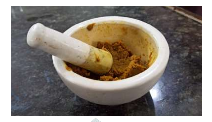
Fig 1:- Polyherbal Scrub.

Formulation, Development & Evaluation Of Polyherbal Scrub.