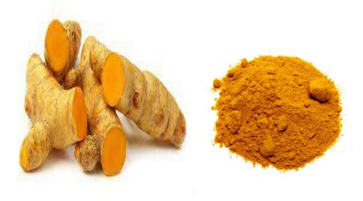
Fig 10:- Turmeric.