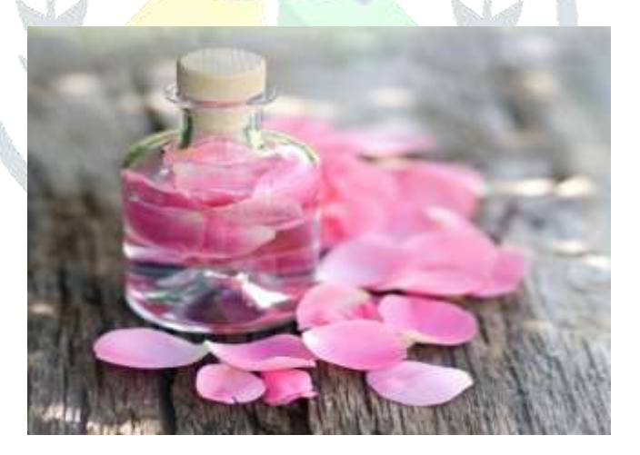
Fig 14:- Rose water.

It should not be a surprise that rose water helps reduce skin redness and enhance complexion given that it has been used as a cosmetic for thousands of years. The antibacterial properties might make acne less severe. The anti-inflammatory properties can lessen skin inflammation and redness.