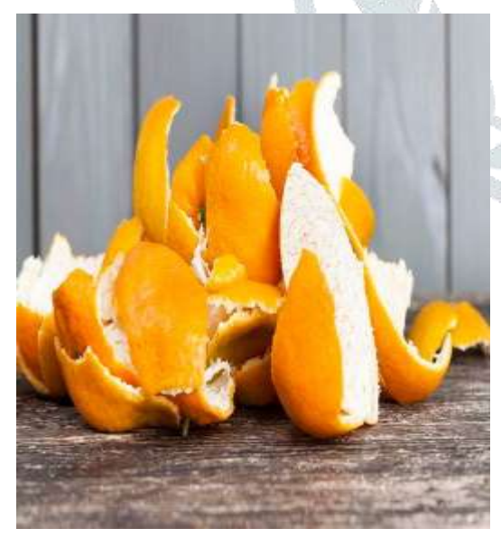
Fig 2:- Orange Peel.

It is often referred to as sweet orange to distinguish it from the closely related Citrusaurantium, commonly referred to as bitter orange. B-carotene, a powerful antioxidant that moisturises, evens out, and softens skin, is found in orange peel and is turned into Vitamin A by the body. Oily skin is hydrated and given new life by orange peel. [9,10]