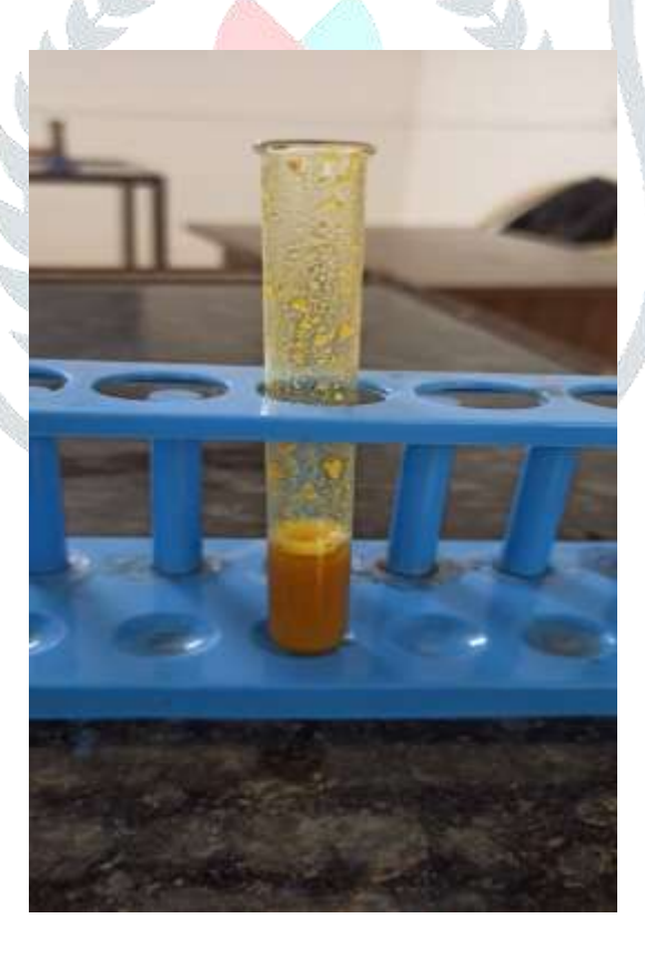
Fig 15:- Foaming Test.