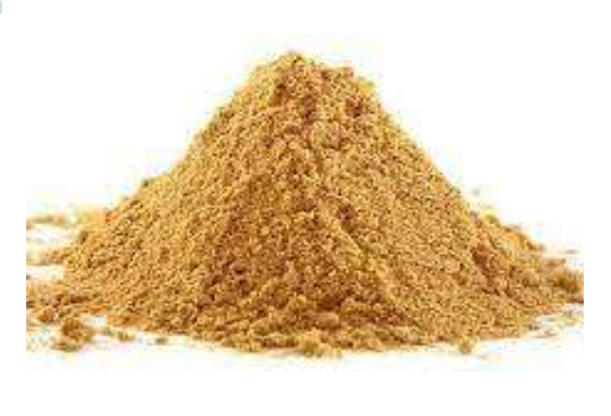
Fig 6:-Sandal wood Powder.