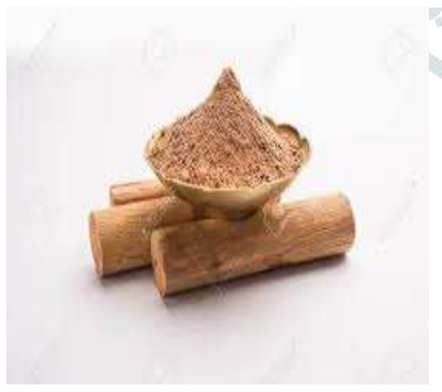
Fig 5:-Sandal wood.