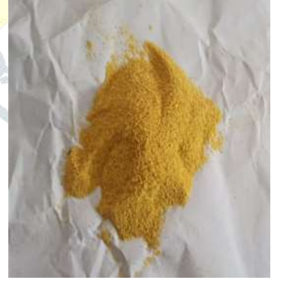
Fig 3:- Orange Peel Powder.