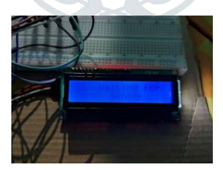
Fig 6. waiting for sensor

The operation of the system for attendance reporting starts with a message showing on the display as waiting for a sensor that indicates to give a valid fingerprint. As shown below the sensor is waiting for fingerprint detection.