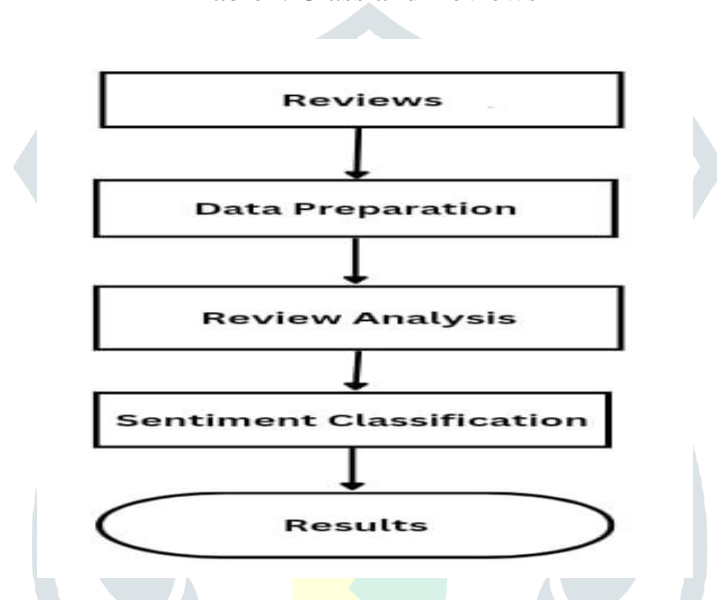
Fig.1 Sample Reviews for sentiment class