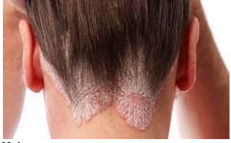
fig 1: Hair anatomy

Psoriasis is an immune- mediated, chronic condition in which skin cells build up and form scales and itchy, dry patches<sup>7</sup>. It disrupts the immune system and instructs the body to grow skin cells faster. These cells do not shed instead it starts building up and causes plaques<sup>7</sup>. Triggers include infections, stress and cold<sup>7</sup>.