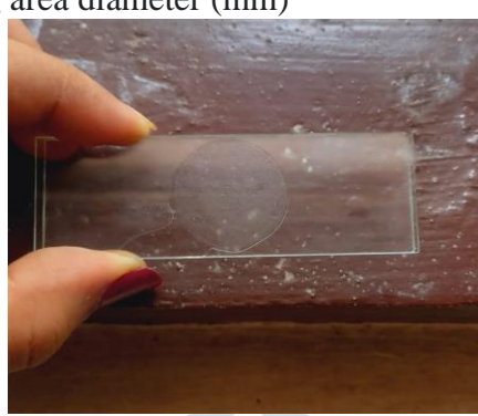
fig 5: Spreadability test

Si- spreading area (mm)2, d- spreading area diameter (mm)