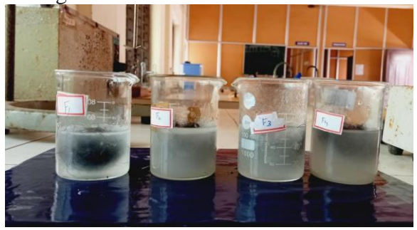
fig 4: Moisturisation time determination

5. Moisturising time determination: 1gm of hairball was placed on the surface of 50 ml of different dilutions of the conditioner. The complete sinking time of hair balls were evaluated.