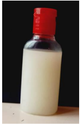
fig 8: Leave-in conditioner

All the four formulations F1,F2,F3,F4 were stable during storage and didn't showed any change in colour, appearance or odour.