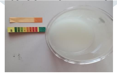
fig 3: pH test

5. Moisturising time determination: 1gm of hairball was placed on the surface of 50 ml of different dilutions of the conditioner. The complete sinking time of hair balls were evaluated.