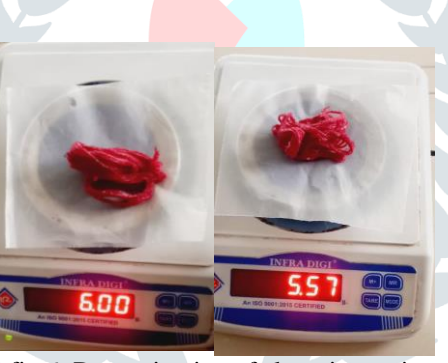
fig 6: Determination of cleansing action

9. Stability testing: Done by placing conditioner in a humidity chamber at 45 degree Celsius and 75% R.H for a period of 3 months.