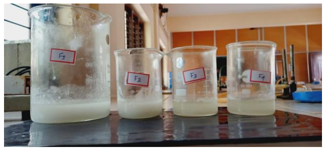
figure 7: All the four formulations

Discussion : The prepared formulation from F1 to F4 was found to be pearlish white in colour, and semi solid in nature, smooth in appearance, clear free of solid particles, and has herbal-minty odour.