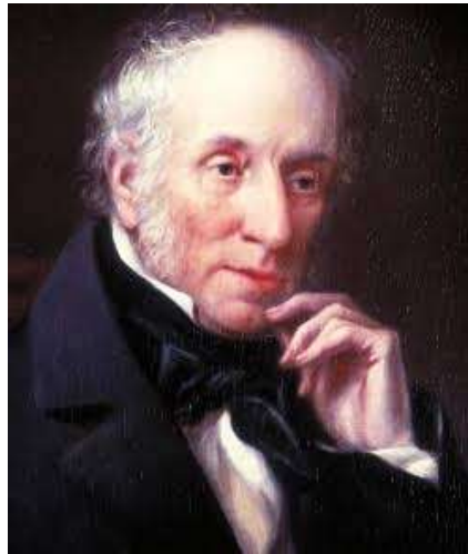
Figure 1: William Wordsworth

between humanity and nature, emphasizing the healing, educative, and transformative power of the natural environment.