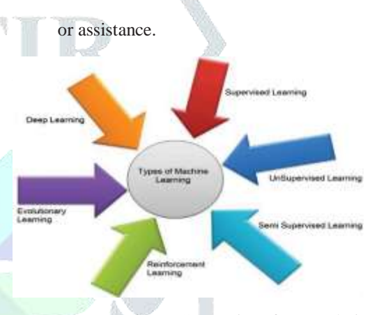
Fig. 1. Categories of ML technique.

out the similarity between the inputs data, and the unsupervised learning techniques classifies the data based on these similarities. It is also known as estimating densities [1].