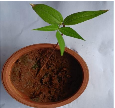
15 Grams of Zinc fertilizer