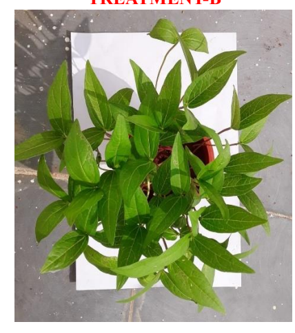
5 Grams of Zinc fertilizer