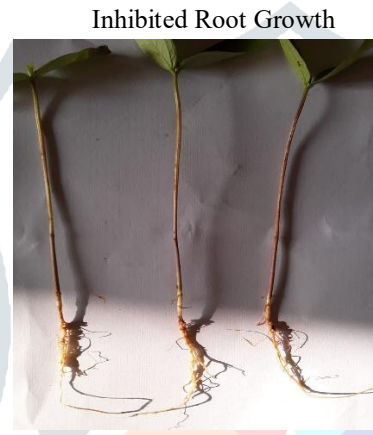
TREATMENT – B