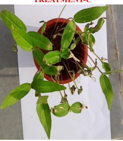
10 Grams of Zinc fertilizer