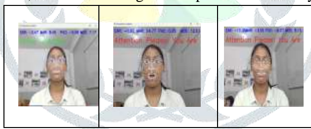
Figure 3 Snapshots of Feature Extraction

Random forest is a popular machine learning algorithm that belongs to the supervised learning process. It can be used for both classification and regression problems in machine learning. It is based on the concept of ensemble learning, which is the process of combining multiple classifiers to solve complex problems and improve model performance. As the name suggests, "A random forest is a distribution with many decision trees onvarious subsets of the given data, which are averaged to improve the accuracy of the data.