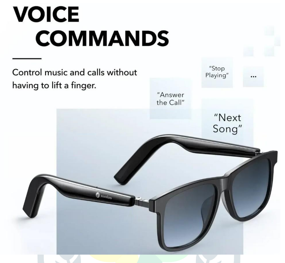
FIGURE 1: Voice commands for Voice-controlled smart glasses