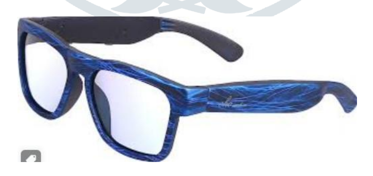
FIGURE 2: Voice-controlled smart glasses