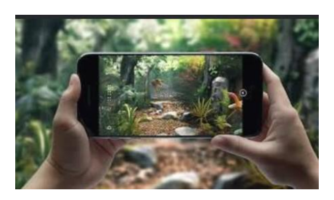
FIGURE 3: Augmented reality technology

glasses (Smith, 2020). Our method of data analysis included a multifaceted examination to ensure that both quantitative and qualitative factors were carefully considered. We were able to develop a complete picture of the effects and consequences of smart glasses in the workplace thanks to this thorough investigation. Our study presents a well-rounded view that illuminates this technology's quantifiable benefits and subtle human experiences by combining statistical rigor with qualitative depth.