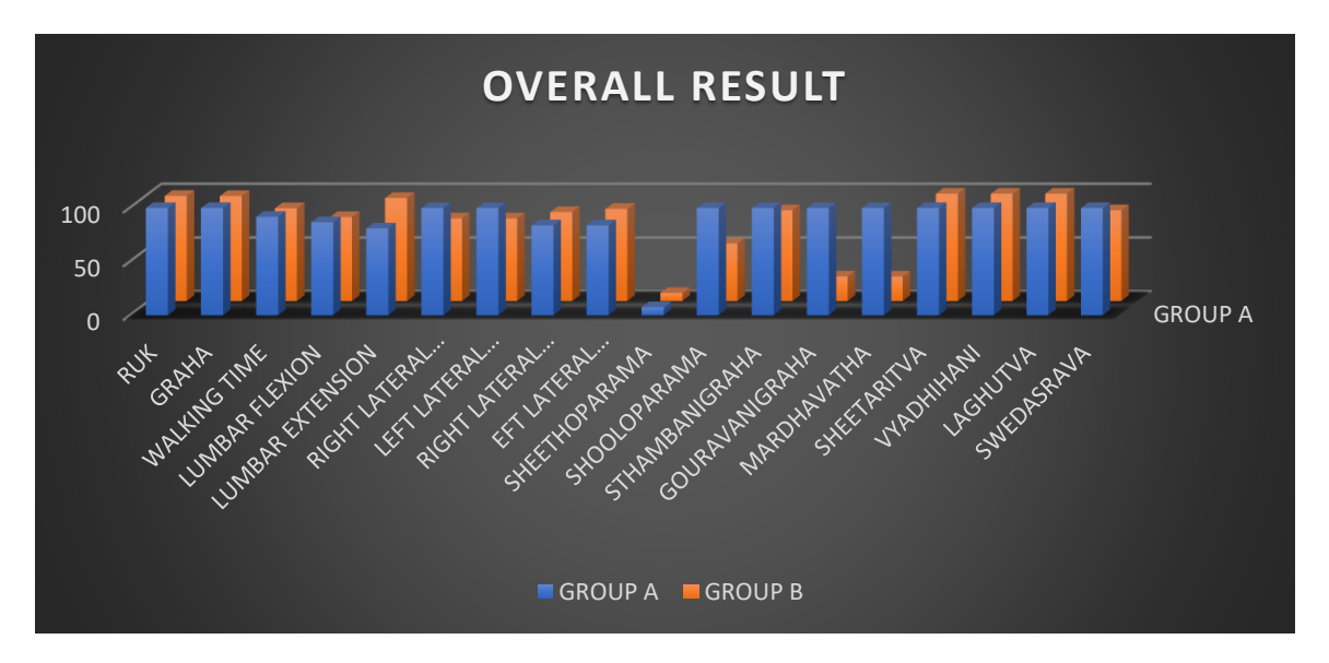
Fig 3- Distribution of subjects based on the Overall result of treatment in percentage