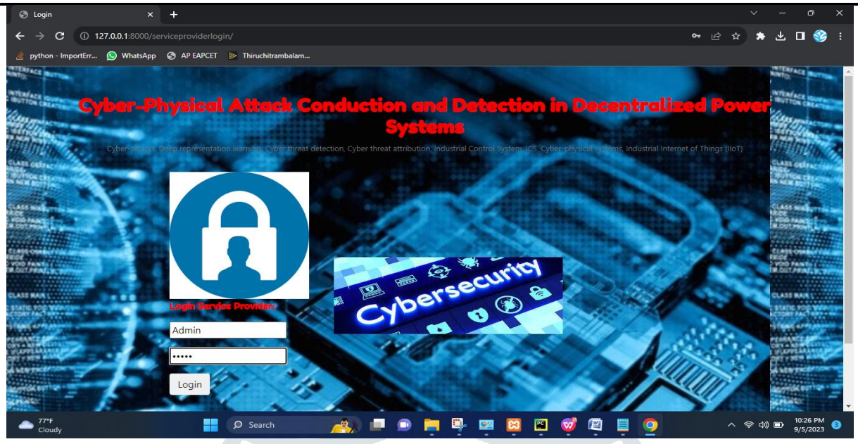
Fig.2 Home page