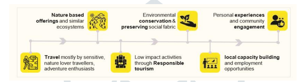
Fig.No.1.1Various stages of eco-tourism

Ecotourism is now defined as a group of low-impact tourism activities that focus on nature and help the local community directly. Based on our study, we know that the current idea of developing ecotourism has gone through several steps, which are shown below: