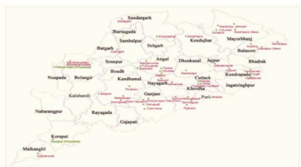
Figure 1.3: Eco tour Nature Camps in Odisha

The ecotourism offerings and products are studied by reviewing existing policy and regulations, evaluating key initiatives and interventions, analysing key trends in ecotourism and identifying major challenges.