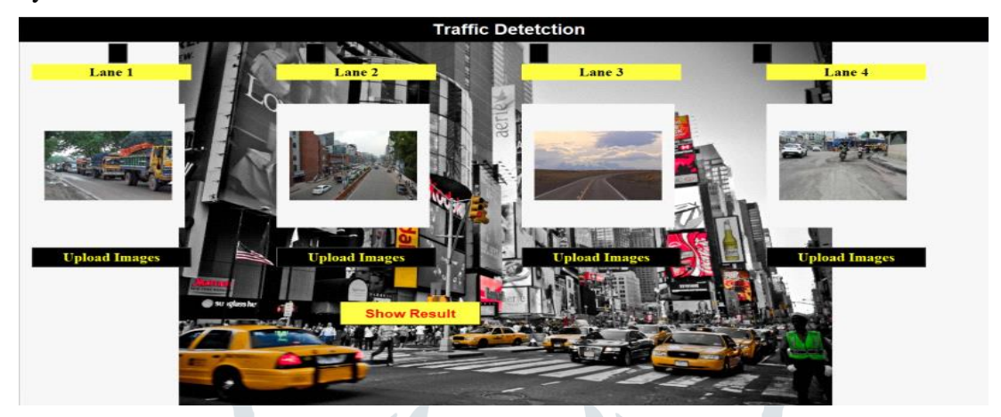
Fig 4.1 Traffic Detection

Overall, the result and discussion part of an AI-powered traffic light system using a CNN sequential model would involve evaluating the system's performance, discussing the limitations and potential challenges, and identifying areas for further research and development. Despite some limitations, the implementation of a CNN sequential model in a traffic light system could lead to significant improvements in traffic flow, safety, and efficiency.