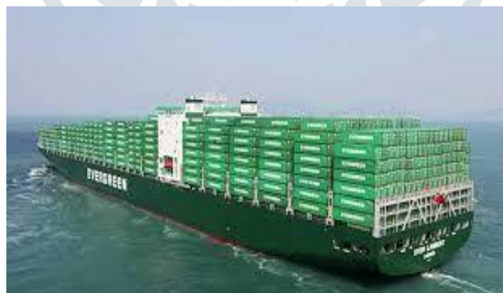
Fig 4 Marine mobility special paints