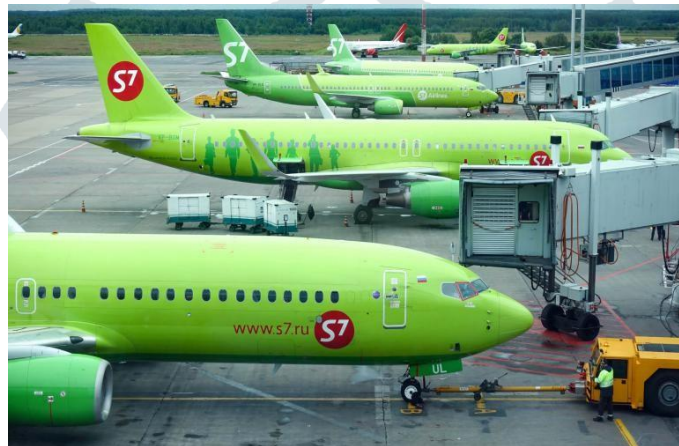
Fig 3 Aviation fuel blending