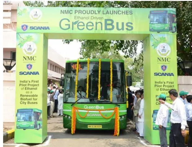
Fig 2: Green Bus at Nagpur

This study focused on analyzing smart city plans, city development plans & master plans of Agra, Ahmedabad, Ajmer, Amritsar, Bhopal, Bhubaneswar, Chandigarh, Chennai, Faridabad, Guwahati, Gwalior, Hubli-Dharwad, Indore, Jabalpur, Kochi, Nagpur, New Town Kolkata, Panaji, Ranchi, Thane, Ujjain (Fig2)