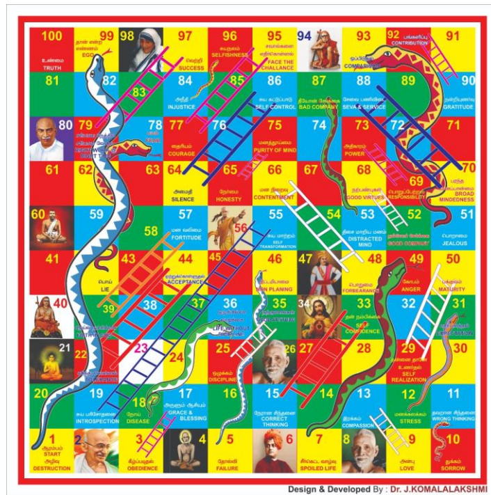
Fig 2. Mentalligence Game board