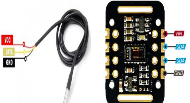
Fig. 1.Pin diagram of ESP32 Microcontroller

Emphasis is on cloud technologies, short- and longrange communications protocols and sensors for tracking various health metrics [12].