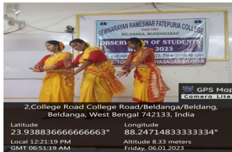
The Observation of Students' Week 2023