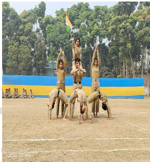
Celebration of Republic Day, 2023