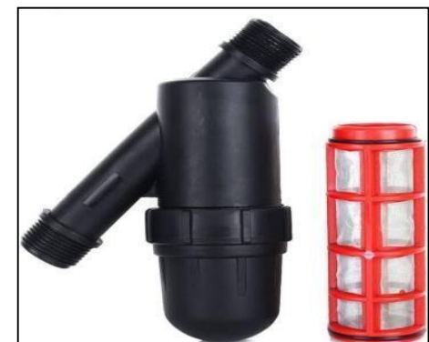
Fig.5. Filtration Bag

Fig.5 shows the image of porous bag that works as garbage bag in the system. Filtration bag are designed to remove debris, sediment, and other particles from water used in systems to prevent clogging of nozzles, and other equipment.