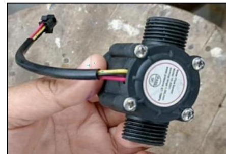
Fig.3. Flow Meter

Fig.3 shows the image of water flow sensor that the system uses to sense the water flow. Flow meters measure the rate at which water or cleaning solution is flowing through the system. This ensures that the right amount of fluid is being circulated, preventing wastage and ensuring that the cleaning process.