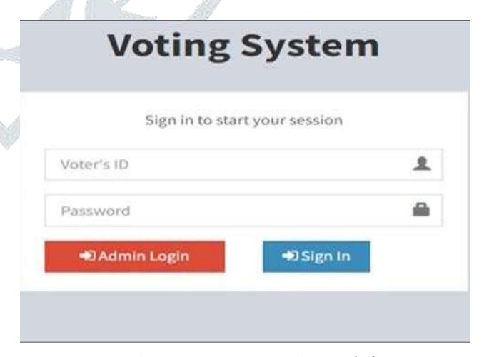
Figure 1: User Login Module