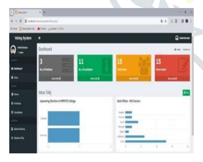
Figure 3: Dashboard

Figure 2 shows the admin login display wherein the admin has to login itself with it's username and password. As many admins can login and can create their own voting dashboards.