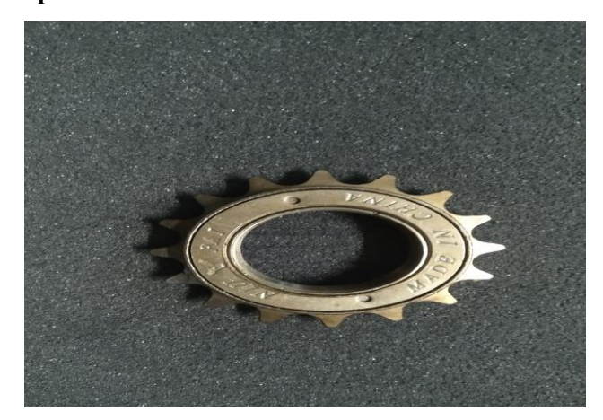
Figure no 4 (Sprocket)

Sprocket is used to connect the rear wheel with the motor by a chain.