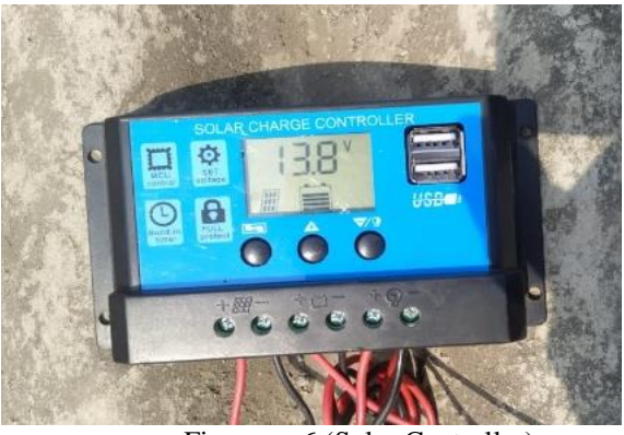
Figure no 6 (Solar Controller)

A solar controller is an electronic device that controls the circulating pump in a solar hot water system to harvest as much heat as possible from the solar panels and protect the system from overheating. The basic job of the controller is to turn the circulating pump on when there is heat available in