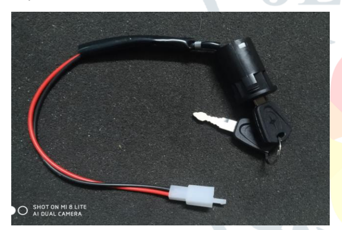
Figure no 10 (Key switch)

Key switch is used to operate the cycle by continuing the supply by key. Just like in bike. It is used for as a power lock. For locking and unlocking the cycle.