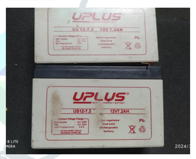
Figure no 3 (Battery)

DC motor convert electric energy into mechanical energy. When DC voltage is applied to the motor, it creates an electromagnetic force that interacts with the magnetic field produced by the stator. This interaction causes the rotor to rotate, as the magnetic forces push and pull it in a continuous motion. A DC motor is an that uses direct current (DC) to produce mechanical force.and forcefully rotate the mechanism.