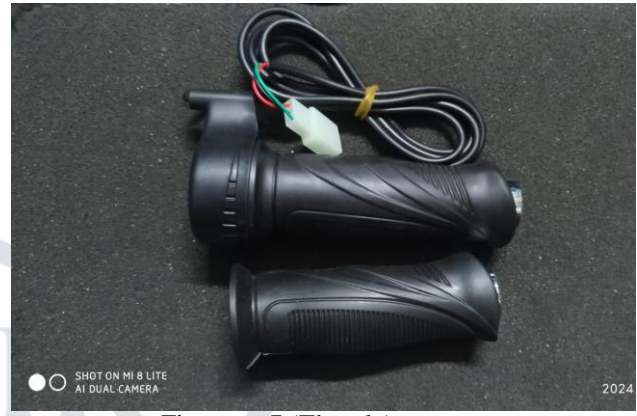
Figure no 7 (Throttle)

Throttle is used for wearing the speed of motor or the wearing the speed of cycle