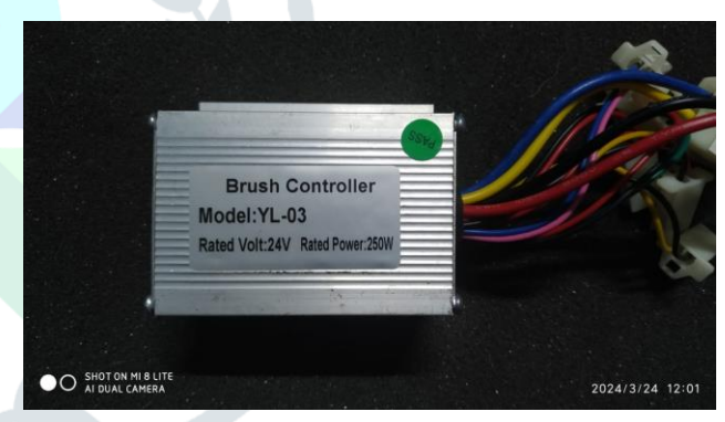
Figure no 8 (Controller)

A brush controller typically regulates the speed and direction of a motorized brush used in cycle. Additionally, brush controllers often incorporate feedback mechanisms such as encoders or sensors to provide real-time data for accurate speed and position control, enhancing overall efficiency and reliability.