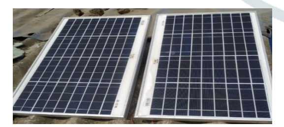
Figure No 1 (Solar Panels)

A solar panel is a device Installed the roof of cycle. There are use 2 panel each panel is 50 watt 1 panel cell quantity is 36 in one cell is 0.5 watt that converts sunlight into electricity by using photovoltaic (PV) cells. PV cells are made of semiconductor materials that produce electrons when exposed to light. The electrons flow through a circuit and produce direct current (DC) electricity, the power storage in battery. Solar panels are also known as solar PV modules.