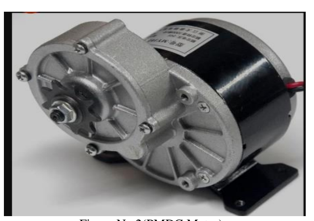
Figure No 2(PMDC Motor)

DC motor convert electric energy into mechanical energy. When DC voltage is applied to the motor, it creates an electromagnetic force that interacts with the magnetic field produced by the stator. This interaction causes the rotor to rotate, as the magnetic forces push and pull it in a continuous motion. A DC motor is an that uses direct current (DC) to produce mechanical force.and forcefully rotate the mechanism.