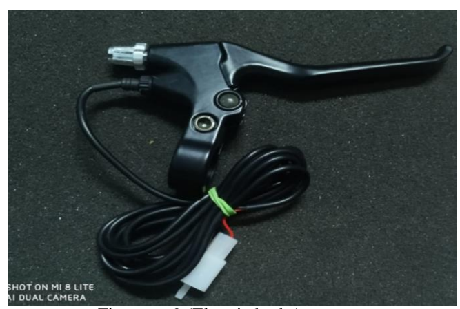
Figure no 9 (Electric brake)

Electric brake is used to cut off the power from the driver and controller. And it is used in two ways, electric way and. Mechanical way, mechanical way will be stop the vehicle by breaking the rim. Rear wheel. When we have to stop the cycle, we have to cut off the power supply from the motor also, so electric brake is used.