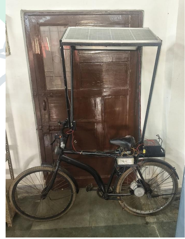
kilometers per hour.

Where The motor is connected to the controller. When battery gives current to the controller then it is sent to the. Accelerator. Key switch add electric braking system. And there is. A button push button on an accelerator which will close the circuit. And provide current to the total when we will accelerate and it varied the speed or increase the speed. So if when we have to stop the vehicle, we have to press. The lever of electric brake which will cut off the circuit from the controller. Of current. And stop the motor. And when we will press the clutch of electric brake then One circuit loop of stoplight will be glow, For backside of vehicle that we have stopped the electric cycle. And there is another switch. For indicating left or right. Which is the controller display shows how many percentage of battery is charged and display. And display how many percent it is charged and the voltage of. Solar panel. Showing the voltage. Like. 27 Volt 26.8, 28.8. And. Our cycle load weight is. Is around 30 KG. Add It can sustain a load of 80 to 90 KG. and it can run about 15 to 20