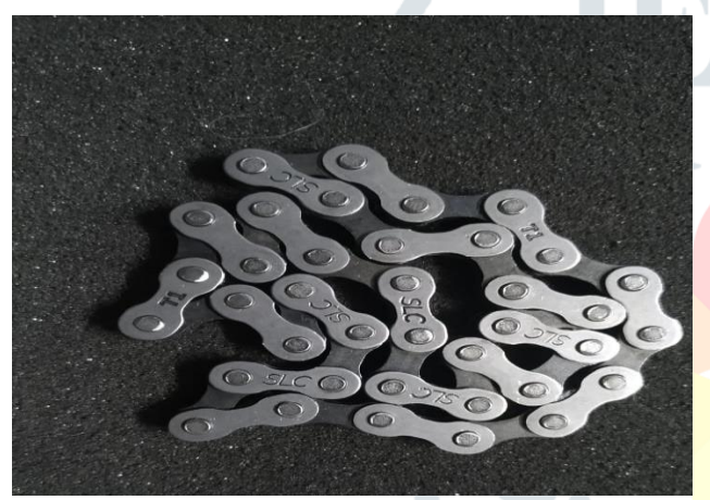
Figure no 5 (Chain)

Chain used to connect the. Gear shaft of motor and rear wheel for driving. And to transmit the power. To the rear wheel.