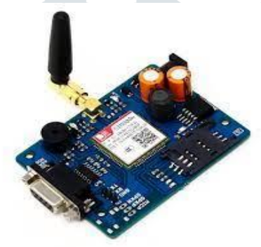
FIG 3: SIM 900A MODULE.

SIM900A is a dependable and incredibly small wireless module. With its SMT design and very potent single-chip CPU that integrates the AMR926EJ-S core, this complete GSM/GPRS module offers you cost-effective options and modest dimensions.