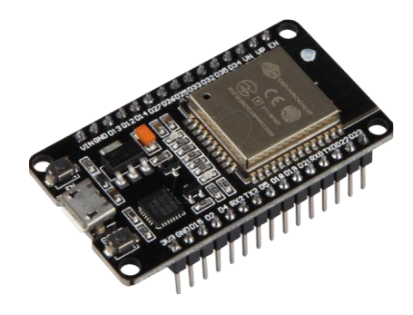
FIG 1: Micro Controller NODEMCU ESP-32.