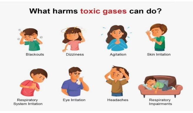
Fig. Harmful effect of toxic gases in human health

Gastrointestinal issues are also a common health challenge, with workers susceptible to gastroenteritis and Pontiac Fever. The exposure to harmful microorganisms in sewage can lead to acute gastrointestinal distress, further emphasizing the need for comprehensive health and safety measures within this profession. As sewage workers play a vital role in maintaining sanitation and public health, addressing these health challenges becomes crucial not only for their well-being but also for the overall effectiveness and sustainability of sewage management systems. Implementing robust safety protocols, providing appropriate protective gear, and offering regular health screenings are essential steps in safeguarding the health of these frontline workers who contribute significantly to public health infrastructure.