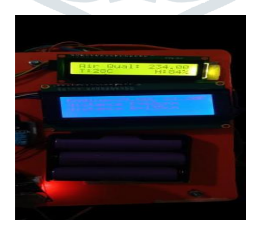
FIG.[4]. DISPLAY RESSULT

Two LCD display shows the parameters which provides the information about car performance.