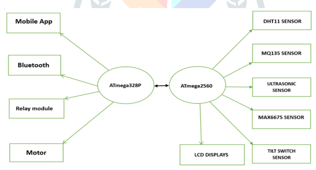
FIG.[1].BLOCK DIAGRAM OF THE SYSTEM.

This system based on 2 controlling modules like Arduino uno & Arduino mega using Arduino uno we are controlled the blutooth control car as a demo model & Using Arduino mega controlled the telemetric sensors like ultrasonic sensor, temperature & humidity sensor, thermocouple sensor, air quality sensor, tilt switch etc.