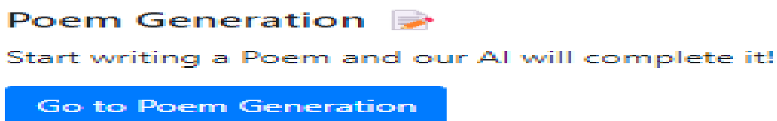
Fig. 3.2.1 Service Select

First the user selects the service for generating a poem based on their input.