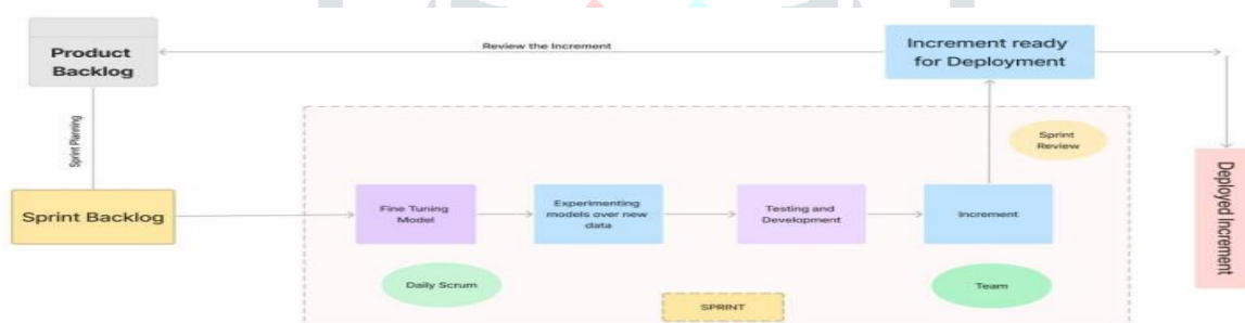
Fig. 2.1 Flowchart of Studios AI

The Scrum framework is a popular and widely adopted agile methodology for managing and organizing complex projects, particularly in the field of software development. It emphasizes flexibility, collaboration, and iterative progress. Scrum provides a structured framework for teams to work in, allowing them to adapt to changing requirements and deliver valuable products or services efficiently.