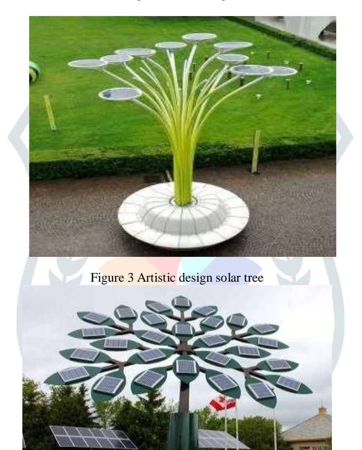
Figure 4 Typical design of solar tree

The panels will be naturally facing towards the sun at an angle as required so that they can collect maximum solar energy in a daytime. These solar trees can be mounted anywhere .like terrace or anywhere near the house, roadsides, in between wide roads / highways, on boundary walls.Maintenance and dust cleaning is also not a big issue.