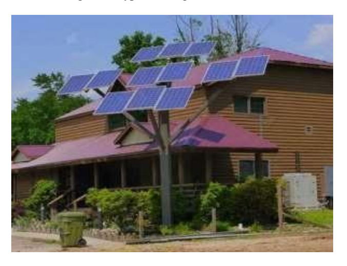
Figure 5 Mounting of Solar Tree near the house