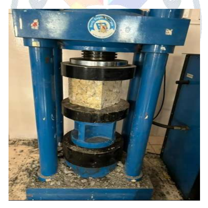
Fig: Cube placed for testing in compression testing machine

Compressive strength (MPa) = Failure load / cross sectional area.