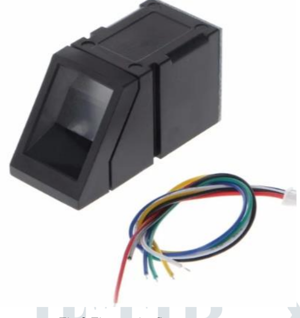
Fig 3 Fingerprint Sensor

3.2.3 UART to USB Converter: Based on SiLabs' CP2102 Bridge, this module converts USB 2.0 to TTL UART. Even laptops without a normal serial port can use this module. With the use of USB, this module turns your computer into a virtual COM port that supports a range of common serial connection Baud Rates. Installing the driver is as simple as utilizing a setup file, which installs the necessary driver files for Windows XP, Vista, and 7. Install the driver and then insert the module into any available USB port on your PC. Finally, the PC has access to a new COM port. The TTL level data i/o is the characteristic that increases convenience.