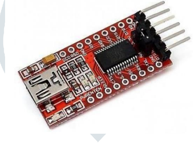
Fig 4 UART to USB Converter

3.2.3 UART to USB Converter: Based on SiLabs' CP2102 Bridge, this module converts USB 2.0 to TTL UART. Even laptops without a normal serial port can use this module. With the use of USB, this module turns your computer into a virtual COM port that supports a range of common serial connection Baud Rates. Installing the driver is as simple as utilizing a setup file, which installs the necessary driver files for Windows XP, Vista, and 7. Install the driver and then insert the module into any available USB port on your PC. Finally, the PC has access to a new COM port. The TTL level data i/o is the characteristic that increases convenience.