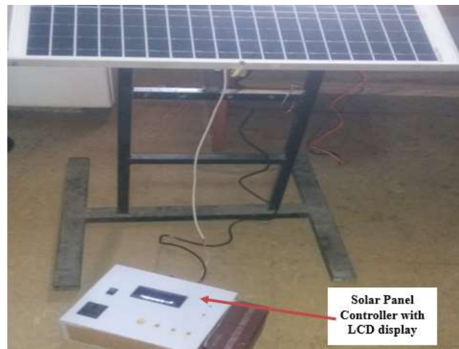
Figure 4: Complete setup of Automatic Solar Tracker System

In this system, by considering 12 hours solar tracking per day, 12 positions were programmed for the solar panel to enable effective tracking of sun's coordinates. When the microcontroller reads the time from the Real Time Clock (RTC) and also compares the solar intensities from the two LDRs, signal is sent to the linear actuator driver so that the panel can be aligned properly facing the sun with certain changes of angular position after predetermined regular time interval. The positions of the solar panel are presented in Table 1.