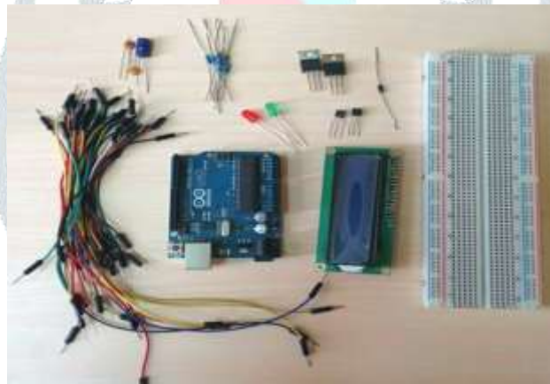
Figure 1: Component Selections for Autonomous Solar Tracker Design

This project is classified into two modules; The hardware prototype and the software design. The hardware prototype was composed of different electronic devices and elementary materials used for the mechanical support. This autonomous solar tracking system was produced by using the basic materials such as Arduino Uno board which was used for programming Atmega328 microcontroller, linear actuator motor, two LDRs, LCD, solar panel which provides 12V as output, RTC module which was used to implement time-triggered task to complement the efforts of the LDRs, and a 12V, 9.2AH battery. The selected components are presented in Figure 1.