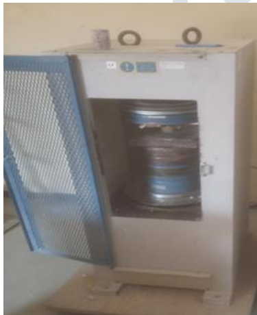
Fig7: Pressure resistance measuring device

Some devices and equipment were used to cut, slice and level the samples. One of these devices was a rock cutting machine to prepare them for testing. Special devices were also used for testing them, such as a pressure resistance device for samples.