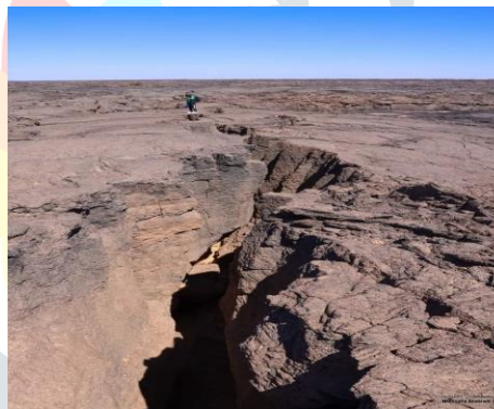
Fig 3: Some faults and cracks in the lava of Harouge