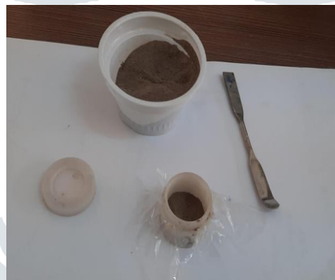
Fig 11: Sample preparation before starting the test

- Sample preparation: This is done by grinding the rock sample into a powder to obtain small and homogeneous grains, so that the sample must be dry, clean and free of dirt and impurities.