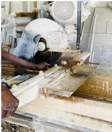
Fig 8: Sample cutting device with required dimensions