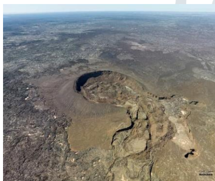
Fig 2: Lava flow center in Al-Harouj area in Al-Fuqaha

Basalt rocks are found in the Haruj region, which extends about 45,000 Km 2 , and are also abundant between the Sukna region and the Fuqaha region [2, 3].