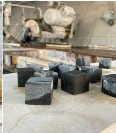
Fig 9: Final sample shape ready for testing

The dimensions of the specimen depend on several factors, including the type of material to be tested, the types of measurements required, the available testing machine, etc. In general, the specimens used in compression tests are usually circular in cross-section, and sometimes square or rectangular cross-section specimens are used for these tests. The ratio between the height of the specimen h and its diameter d is also very important to avoid some undesirable situations, as increasing the height increases the tendency for the specimen to buckle and the accompanying irregular distribution of stress across the specimen section. The specimens used in this test are cubic specimens.