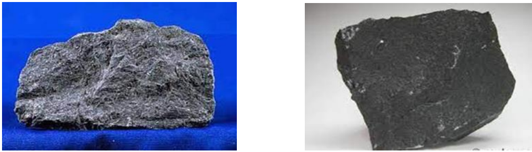
Fig 6: Basalt rocks taken from the Sukna area before the cutting process