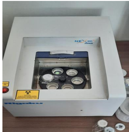
Fig 10: XRF testing device