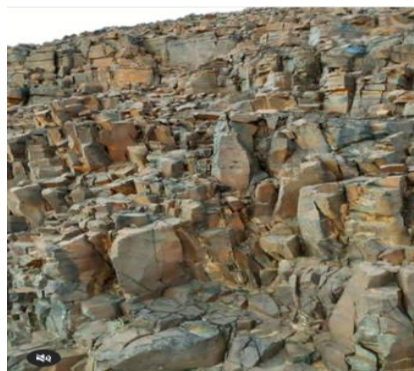
Fig 4: Rocky mountains near the sampling sites