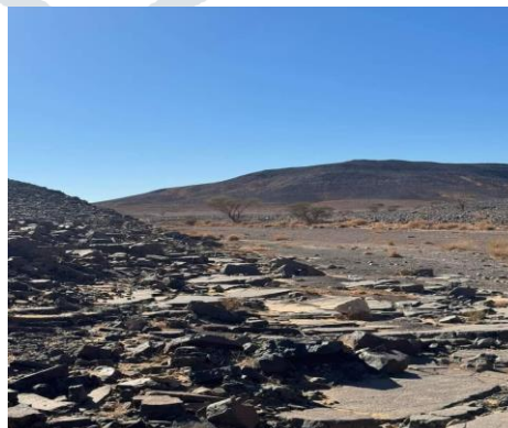
Fig 5: Volcanic rocks are present as scattered rocks in the sampling area.