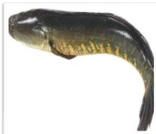
Channa striata (Snakehead fish)