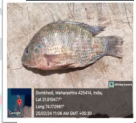
Oreochromis niloticus (Nile tilapia)