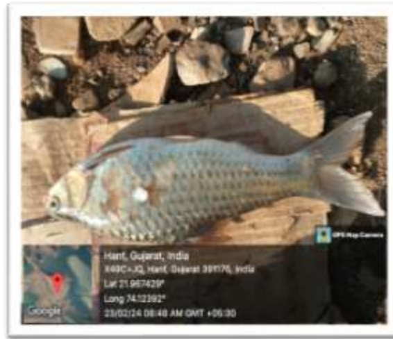
Barbanyms gonionotus (Java barb)