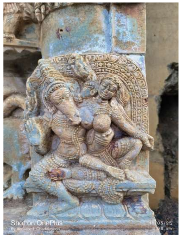
figure 7 varaha avatara and bhudevi miniature sculpture

On the eastern wall of the same temple, on the top of the "Upana," there is a sculpture of Nataraja, along with Brahma and Vishnu. On the north wall of the Santana Malleswara Swamy temple, there is a miniature sculpture of a begging woman on the Kumbha Panjaram. On the eastern wall, on the first Kumbha Pattika, there is a sculpture of Kalyanasundara murti, and on the second Kumbha Pattika, there are miniature sculptures of Vrushabadha murthi along with Lord Ganesh and Murugan. On the southern wall, beside the first Kumbha Panjara of the Santana Malleshwara Temple, there is a 6-inch-tall Gauri Kalyana scene. Here, Vishnu is offering Gauri Devi as a "Kanyadanam" to Shiva. In this scene, Brahma is seen in a 3-inch size. On the left side of the Kumbha Panjar on the same wall, there is a sculpture of Vrishabadha murthi. On the 5-inch Nandi, Shiva and Parvati are seen in a 2-inch height. Tiny