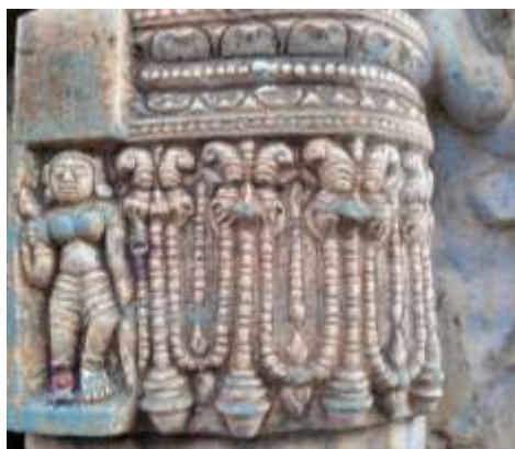
figure10- 4 in miniature sculpture with decoration