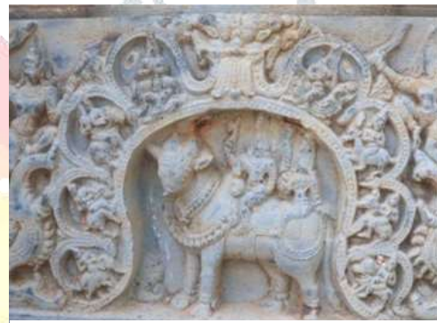
figure 8 vrisbhadaramurthi with dikpalakas