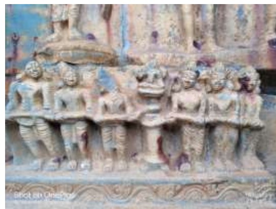
figure 11 sagaramadhanam miniature sculptures

Conclusion : Chennakesava temple complex at pushpagiri it has as know as dakshina kasi and stood as the greatest contribution from kings of Klayana chalukya to Vijayanagara,. It is understood the temple was devolved by vijayanagara kings mostly with beautiful carvings in miniature scale which recollect us Hoysala style. Now a days number of pilgrims are visiting this temple and performing