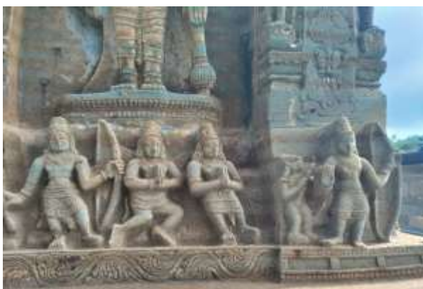
figure 4 Rama hanuma and lakshmana miniature sculptures at south wall of chennakeseshava temple

Ramayana Story: In the Chennakeshava Temple complex premises, miniature sculptures from Balakanda ,