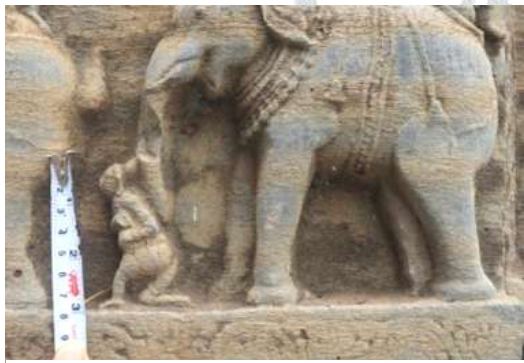
figure 9- 3 in miniature sculpture

On the eastern wall of the Chennakesava temple, the dasha avatars—Kurma, Matsya, Varaha, Vamana, Narasimha, Rama, Krishna, and Kalki—and on the southern wall, the scene of gods and demons churning the ocean of milk are also carved in miniature sculptures. In addition, the miniature decorative sculptures in the Chennakesava temple complex are carved in the Hoysala style. The 6-inch-tall Dashavataras are beautifully carved and are mostly seen on the north and south walls of the Chennakesava temple. Scenes related to Kiratarajunyam are also found here. More than 2500 miniature sculptures can be seen in this temple complex. But many of these sculptures have been partially damaged.