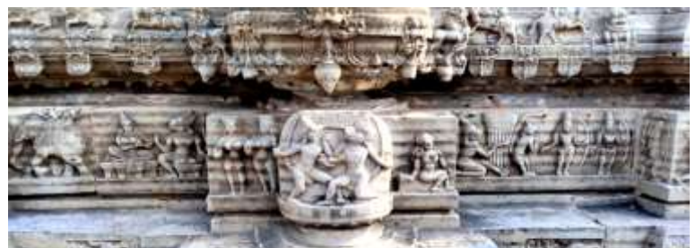
figure 5 on the wall to the south of the verandah is a scene from the kishkinda chapter of the ramayana depicting the battle of vali with sugriva