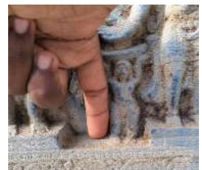
figure 6 umamaheswara temple north wall upana kalyana sundaramurthi and 2 inches sculpture