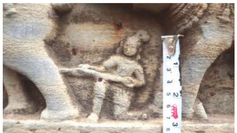
figure 3- 3 inches hight sculpture on the south wall of temple

The outer walls of the garbhagriha of the “ Chennakesava ” Swamy , Santana Malleswara Swamy , and Umameswara temples have almost the same structure. The Upapita , Adistana , and wall pillars have kapota . But the Umamaheswara Swamy temple looks a little different in