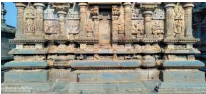
figure 1 chennakesava temple east side wall

This temple is located on the eastern bank of the Penna River near Chennur village, about fifteen kilometers from Kadapa. The temple complex consists of the temples of “ Chennakesav Swamy ”, Santanamalleswara Swamy , and Umamalleswara Swamy . It is noteworthy that Shiva Kesava is housed in the same courtyard. It is also known as Dakshina Kashi due to the confluence of the five rivers here. The “ Chennakesava ” temple complex consists of three temples with a rectangular mandapa built with eight pillars. Of these three temples, one is dedicated to Vishnu in the form of “ Chennakesava ,” and the other is dedicated to Shiva, called Santanamalleswara , which are located next to each other and face west towards the east of the mandapa and open into a rectangular mandapa . The third is called the Umamaheswara temple , which is situated on the north side of the mandapa facing south and at right angles to the Santanamalleswara temple. All three temples display similar architectural features. The inscriptions found there indicate that the gopuram structures of these three temples were in ruins by the end of the 15th century. The lower walls of these temples are said to have been repaired by Aghorashivacharya in the year 1423 1 (A.D. 1501).