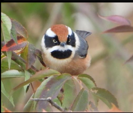
5- Black Throated Tit