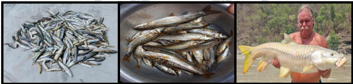
4- Silver Rasbora