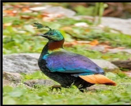
7-Himalayan Monal male