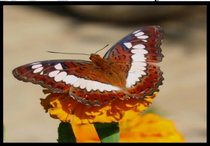
6- Commander Butterfly