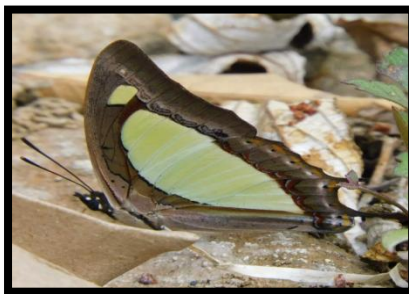
7- Polyura Athamas