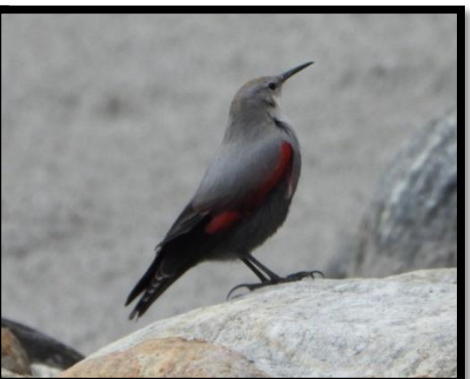
12- Tichodroma Murari