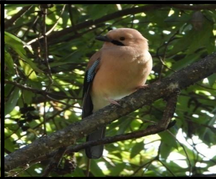
8- Eurasian Jay