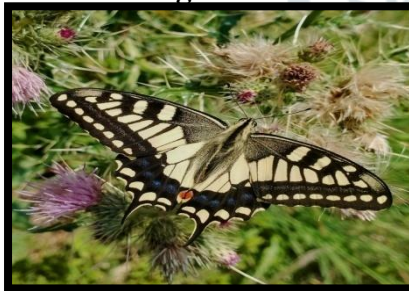
4-Old World Swallowtail