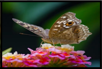
3- Lemon Pansy