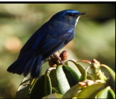
11- Slaty- Blue Flycatcher