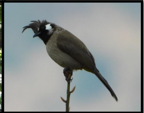
9- Himalayan Bulbul