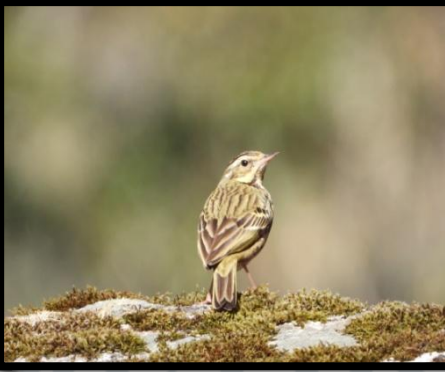
2- Anthus Berthelotii