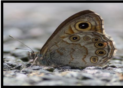
1- Large Wall Brown