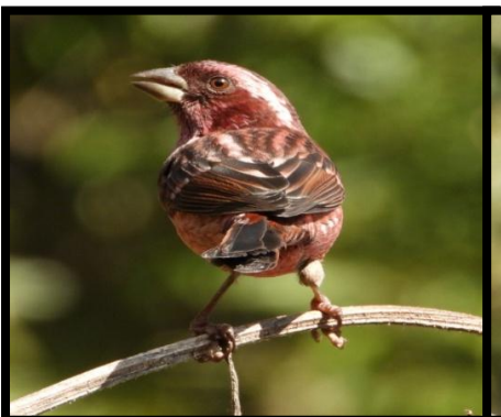
10- Pink browed rose finch