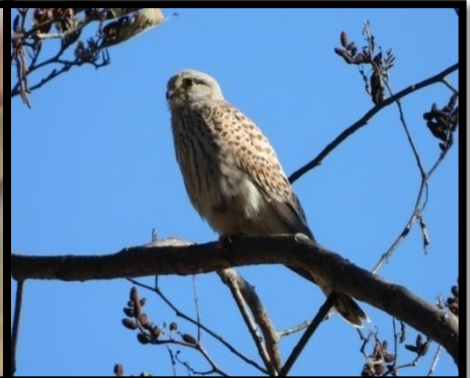
6- Common Kestrel