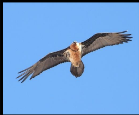
4- Bearded Vulture