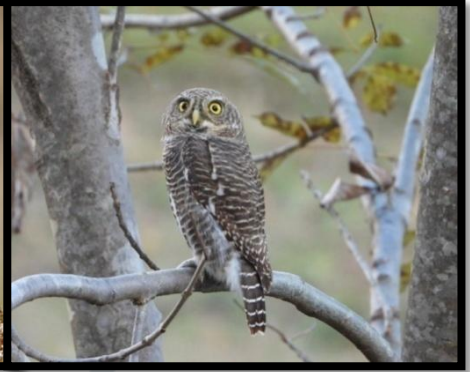
3- Asian Barred Owlet