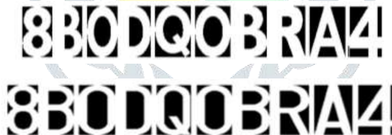
Figure-4: templates images.

Here we will show some templates which have highly similarity.