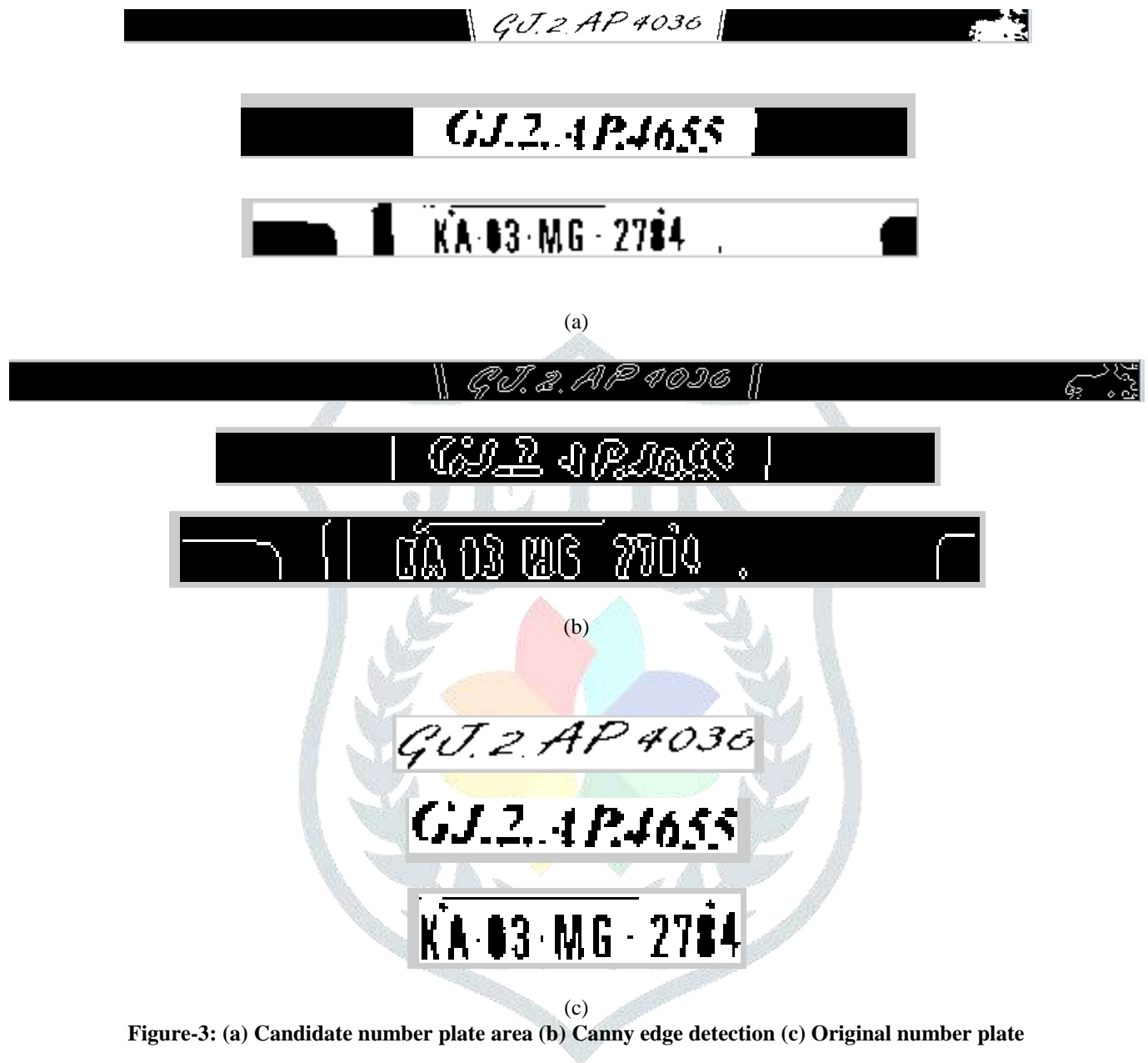
Figure-3: (a) Candidate number plate area (b) Canny edge detection (c) Original number plate

Determine which row has the greatest changes, or amplitude. After that, scan the pictures from that reference line both up and down. And so on, until the initial local minimums are reached on both the upward and downward sides. The top and bottom lines on the number plate are these two lines. We must horizontally crop the image on the bases of the top and bottom boundaries; this is known as the candidate number plate area. A few instances are displayed in figure 3(a).