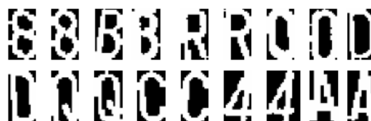
Figure-5: Target images.

Additionally, the target image's and the template image's vectors are available to us. Next, determine the Euclidean distance between the target image's vector and the template image's vector. Identify the template that has the least distance to our recognized character.