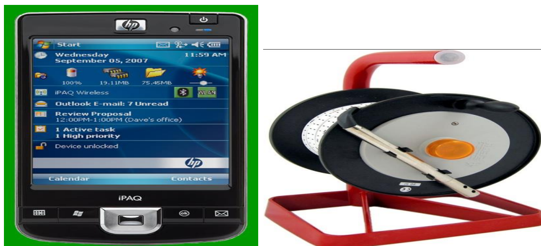
Fig. 2 showing GPS instrument, and Water level indicator instrument