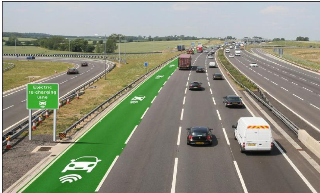
FIG.1 ELECTRIC RE-CHARGING LANE

KAIST has made great achievement on EV dynamic wireless charging in the last few years, which is called on-line electric vehicles (OLEV). The OLEV project was launched in 2009. In the same year, 3 generations of prototypes were reported with power ranger from 3 to 17kW [24]. The first demonstration, a 2.2 km tram loop, was installed in Seoul Zoo on March 2010. This 62kW wireless powered tram has a 40% smaller battery package than normal battery powered trams. At Expo 2012, an OLEV bus system was demonstrated which was able to transfer 100kW (5*20kW pick-up coils) through 20cm air gap with average efficiency of 75%. The battery package is further reduced to 1/5 [25].