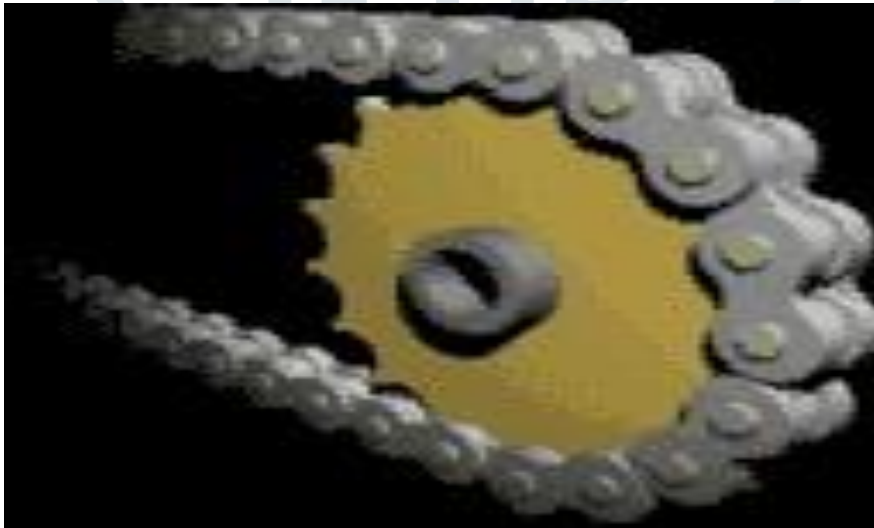
Fig Sprocket Chain

Sprocket or sprocket-wheel is a profiled wheel with teeth, cogs, or even sprockets that mesh with a chain, track or other perforated or indented material. The name 'sprocket' applies generally to any wheel upon which radial projections engage a chain passing over it. It is distinguished from a gear in that sprockets are never meshed together directly, and differs from a pulley in that sprockets have teeth and pulleys are smooth. Sprockets are used in bicycles, motorcycles, cars, tracked vehicles, and other machinery either to transmit rotary motion between two shafts where gears are unsuitable or to impart linear motion to a track, tape etc. Perhaps the most common form of sprocket may be found in the bicycle, in which the pedal shaft carries a large sprocket-wheel, which drives a chain, which, in turn, drives a small sprocket on the axle of the rear wheel. Early automobiles were also largely driven by sprocket and chain mechanism, a practice largely copied from bicycles. Sprockets are of various designs, a maximum of efficiency being claimed for each by its originator. Sprockets typically do not have a flange. Some sprockets used with timing belts have flanges to keep the timing belt centered.