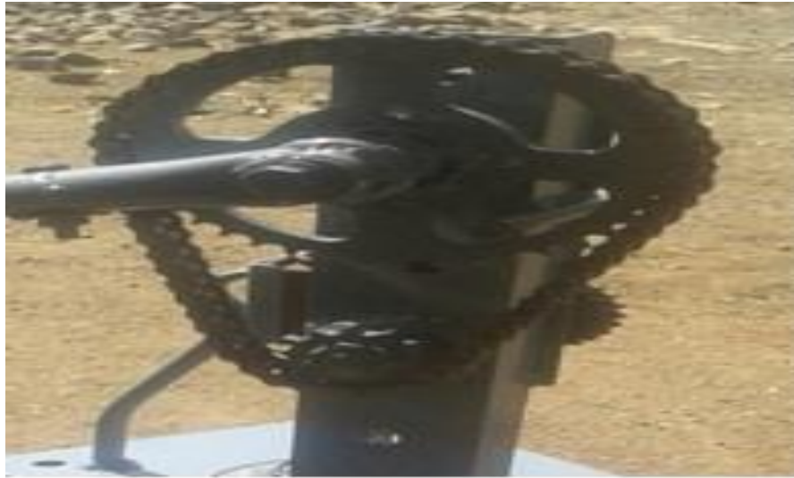
Fig Sprocket and chain arrangement.