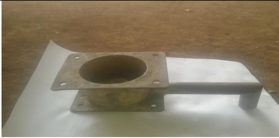
Fig Water Chamber.