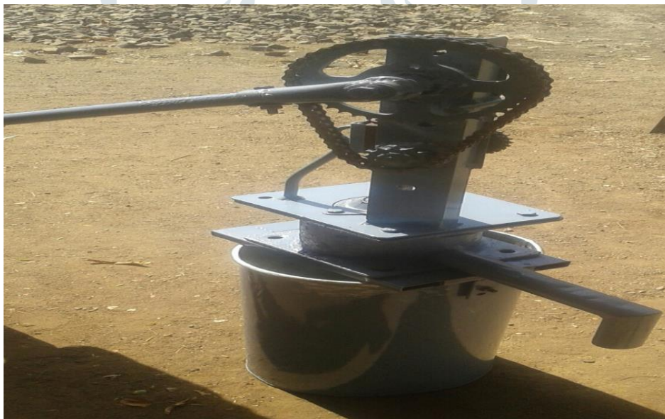
Fig Reciprocating suction pump

Compression Stroke: During this stroke piston rod moves downward and water enters in the chamber. And piston comes to downward position. In this way pump operates.