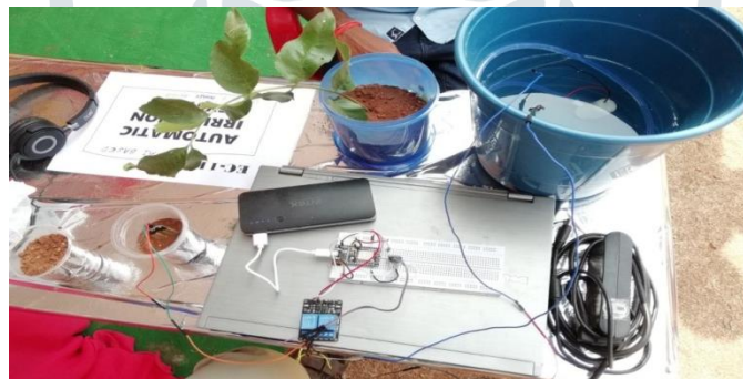
Fig 4: Final Project model

The amount of water required for a plant is not equal for all the plants. So the moisture value will be different for plant to plant. For example: the moisture level required for NEEM plant is 800m 3 thus, the threshold value of 800m 3 is taken. The moisture value of the neem plant at different times is as shown below: