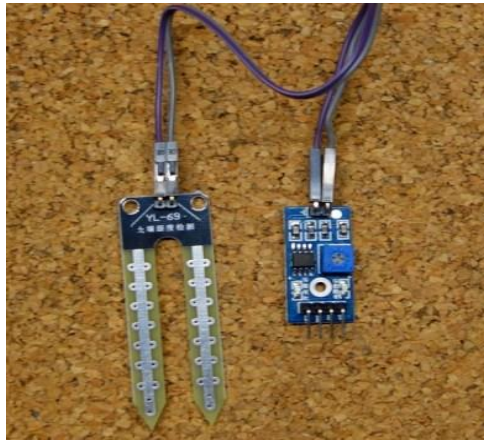
Fig 2: Moisture Sensor

Soil moisture sensors typically refer to sensors that estimate volumetric water content. Another class of sensors measure another property of moisture in soils called water potential; these sensors are usually referred to as soil water potential sensors and include tensiometers and gypsum blocks.