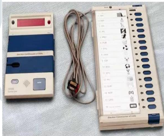
Fig1: Electronic voting machine

Electronic Voting Machine (EVM) is a simple electronic device used to record votes in place of ballot papers and boxes which were used earlier in conventional voting system. Fundamental right to vote or simply voting in elections forms the basis of democracy. All earlier elections be it state elections or centre elections a voter used to cast his/her favorite candidate by putting the stamp against his/her name and then folding the ballot paper as per a prescribed method before putting it in the Ballot Box. This is a long, time-consuming process and very much prone to errors. This situation continued till election scene was completely changed by electronic voting machine. No more ballot paper, ballot boxes, stamping, etc. all this condensed into a simple box called ballot unit of the electronic voting machine. Because biometric identifiers cannot be easily misplaced, forged, or shared, they are considered more reliable for person recognition than traditional token or knowledge based methods. So the Electronic voting system has to be improved based on the current technologies viz., biometric system. This article discusses complete review about voting devices, Issues and comparison among the voting methods and biometric EVM.