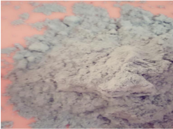
FIG.1. HOSPITAL WASTE ASH