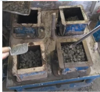
Figure 2: Hand compaction

Hand compaction of concrete is adopted in case of small concrete works. Sometimes, this method is also applied in such situation, where a large quantity of reinforcement is used, which cannot be normally compacted by mechanical means. Hand compaction consists of rodding, ramming or tamping. When hand compaction is adopted, the consistency of concrete is maintained at a high level. Tamping is one of the usual methods adopted in compacting roof or floor slab or road pavements where the thickness of concrete is comparatively less and the surface to be finished smooth and level.