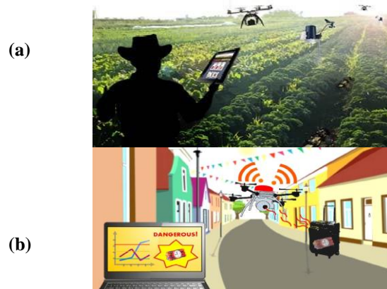
Fig.1. (a) Drones are flying above the farm land and working like swarm and (b) Sensor drone is detecting the hidden explosive material.

In agriculture, E-noses were applied in many applications such as detection of awful smell from swine farm, hazardous elements from food industry, quality grade identification of green tea, etc. E-nose consists of an array of various chemical gas sensors that present distinct gas-sensing behaviors. The different selectivity of each gas sensor is very useful for classification and analysis of the odor data via pattern recognition techniques such as principal component analysis (PCA). Because a typical quadcopter cannot load a heavy thing, so the weight of E-nose system and other necessary equipment must be light enough. Among the available types of sensing materials applicable for E-nose system on mobile robot, polymer/carbon nano tube nano composite gas sensors are the most popular due to their high sensitivity, high reversibility, ease of maintenance and low power consumption that helps reduce weight of the battery. However, development of E-nose on drone for agriculture and industry has been rare, and most E-nose on UAV applications are still involved with the use of only one or two gas sensors. For such reasons, it is very important to develop a drone platform that integrates both E-nose and robotic technology together for field deployment.