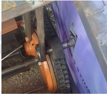
Figure:Roller,Bearing and Shaft