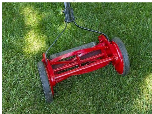
Figure: Cylindrical Blades

Cylinder lawn mowers have cylindrical blades that rotate vertically at the front of the mower. They cut against a fixed blade at the bottom. The cylinder should have multiple blades – three or more is best. Cylinder lawnmowers are best for flat lawns that you want to keep short and well-manicured. They can be electric, petrol-powered and push mowers.