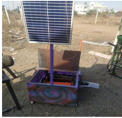
Figure: Machine with solar Panel