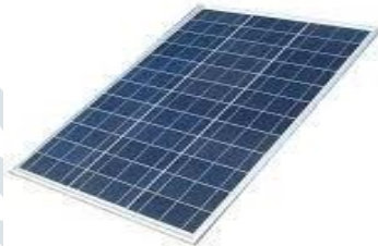
Figure: Solar Panel

The term solar panel is used colloquially for a photo-voltaic (PV) module. A PV module is an assembly of photo-voltaic cells mounted in a frame work for installation. Photo-voltaic cells use sunlight as a source of energy and generate direct current electricity. A collection of PV modules is called a PV Panel, and a system of Panels is an Array. Arrays of a photovoltaic system supply solar electricity to electrical equipment.