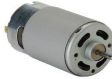
Figure: DC Motor

A DC motor is any of a class of rotary electrical motor that converts direct current electrical energy into mechanical energy. The most common types rely on the forces produced by magnetic fields. Nearly all types of DC motors have some internal mechanism, either electromechanical or electronic; to periodically change the direction of current in part of the motor.