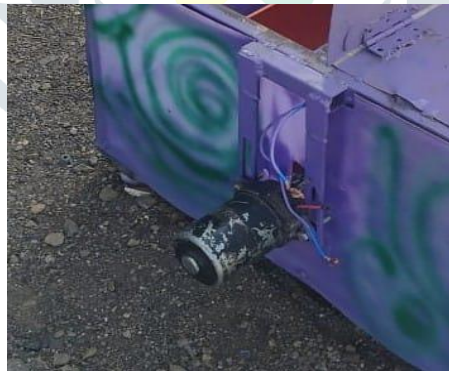
Figure: DC motor connected to body