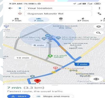
The fig4 represents the map when user touch on the vehicle number this map is open which represents the location of vehicle along with route as well as timing.

The flowchart for this application consist of first starting of android application. The application of driver can connected to the database. The user application is also connected to the database. If the driver and user application both are active the it will exchange the data.Then the user can click on the application to view the google map ,then the google map will be displayed to the user. At the end both application will be closed.