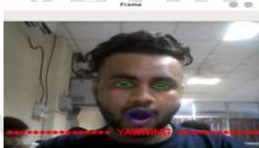
Fig 2: Proposed System detecting the opened mouth of the person considering it to be Yawning.

When the required locations and possible extractions of the mouth are obtained, this algorithm minimizes the categories of mouth into single oriented positive labeled detections. The drowsiness of the driver sitting in the vehicle is categorized by the high-frequency mode of yawning. If the opening of the mouth is monitored more than 3 sec, the driver is detected to be yawning and the corresponding threshold which increases the counter of the yawning. Further, the status of the threshold is checked, if it is reached to the extent of a limit, an alarm will be raised, otherwise, it will again go to the next frame for face detection.