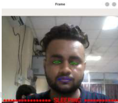
Fig 1: Proposed System detecting the closed eyes of the person.

Now that we have the eye regions, we can compute the eye aspect ratio in which we create a function to compute the ratio of the distance between vertical eye landmarks and horizontal eye landmarks. If the eye aspect ratio indicates that the eyes have been closed for a sufficiently small amount of time, the driver will sound an alarm. The condition is on true and it follows the above method then the driver is drowsy and should be alerted.