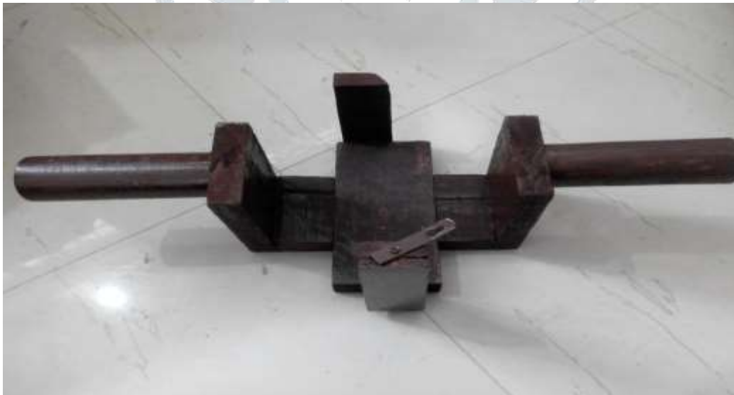
Figure: 4 – Tilting Mechanism

The tilting mechanism is a mechanism that is used for lifting and tilting the furnace to some angle so that it will be easy for collecting molten metal. The tilting mechanism is made up of wood and a casing is further provided which is holding the furnace-mold. The dimensions of the casing are 30×30×19cm.