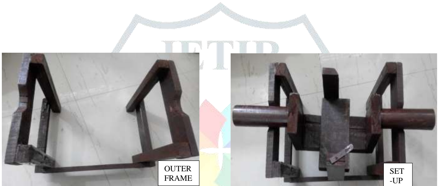
Figure:6-Fabricated outer frame and final assembled Set-up

And the whole wooden casing along with the electrodes are placed on the base and the mold is rotated with the help of the wooden rods fixed on either side of the casing according to our convenience and safety, such that the molten metal is collected properly. The structure which was described in preceding lines is shown in the figure. The dimensions of the base are 45 x 35 x 35 cm. The whole assembled setup with the casing is as shown in figure 6.