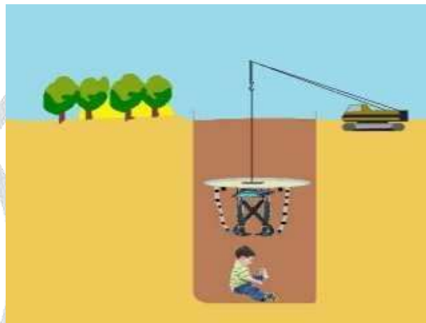
Fig.2. Previous Existing Method

Our proposed system consists of mainly two round plates. The full hardware system has been illustrated by the. A mechanical system will be attached to the higher plate which will try to release two linear actuation units which will hold the system in position by pushing the wall of the bore-well. Another mechanical gear system will be attached which will rotate the lower plate to get position it in plane with the victim. Two arms will be attached to the lower plate. Two high resolution cameras will be attached downwards in the lower position of the lower plate. The high-resolution cameras will provide the view of the well environment which will be highly helpful in telecom the two arms. As the bore well environment is a dark environment the system will be having lights which will provide enough lighting conditions for the operation of the system. The pneumatic arms will be having another two individual cameras for each arm which will publish the view of the arms. A chest mount harness will be attached with the system which will be highly essential in picking up the victim from the bore well.