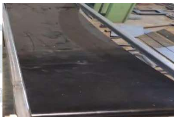
Figure.5: Image of Conveyor Belt