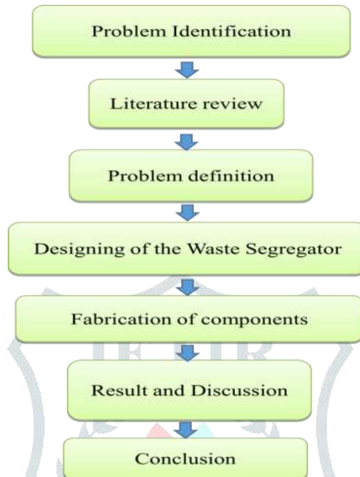
Figure.1 Methodology of Project work

The sequence of the work carried out is represented by a flow chart in Figure1. The project work commenced from identifying the problem followed by collecting the available relevant work through literature survey.