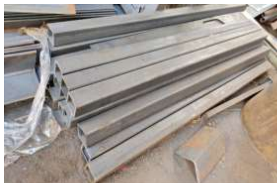
Figure.4 Image of Mild steel tubes