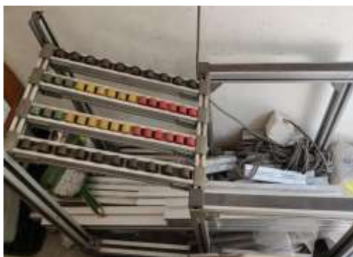
Figure.4 Image of Plastic conveyor roller