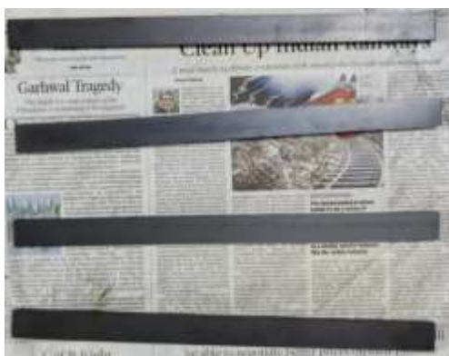
Figure.3 Image of Industrial grade magnetic strips

. The images of these components is shown below in above mentioned sequence.