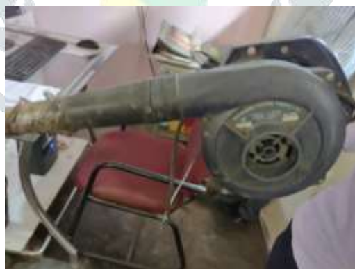
Figure.6: Image of Blower