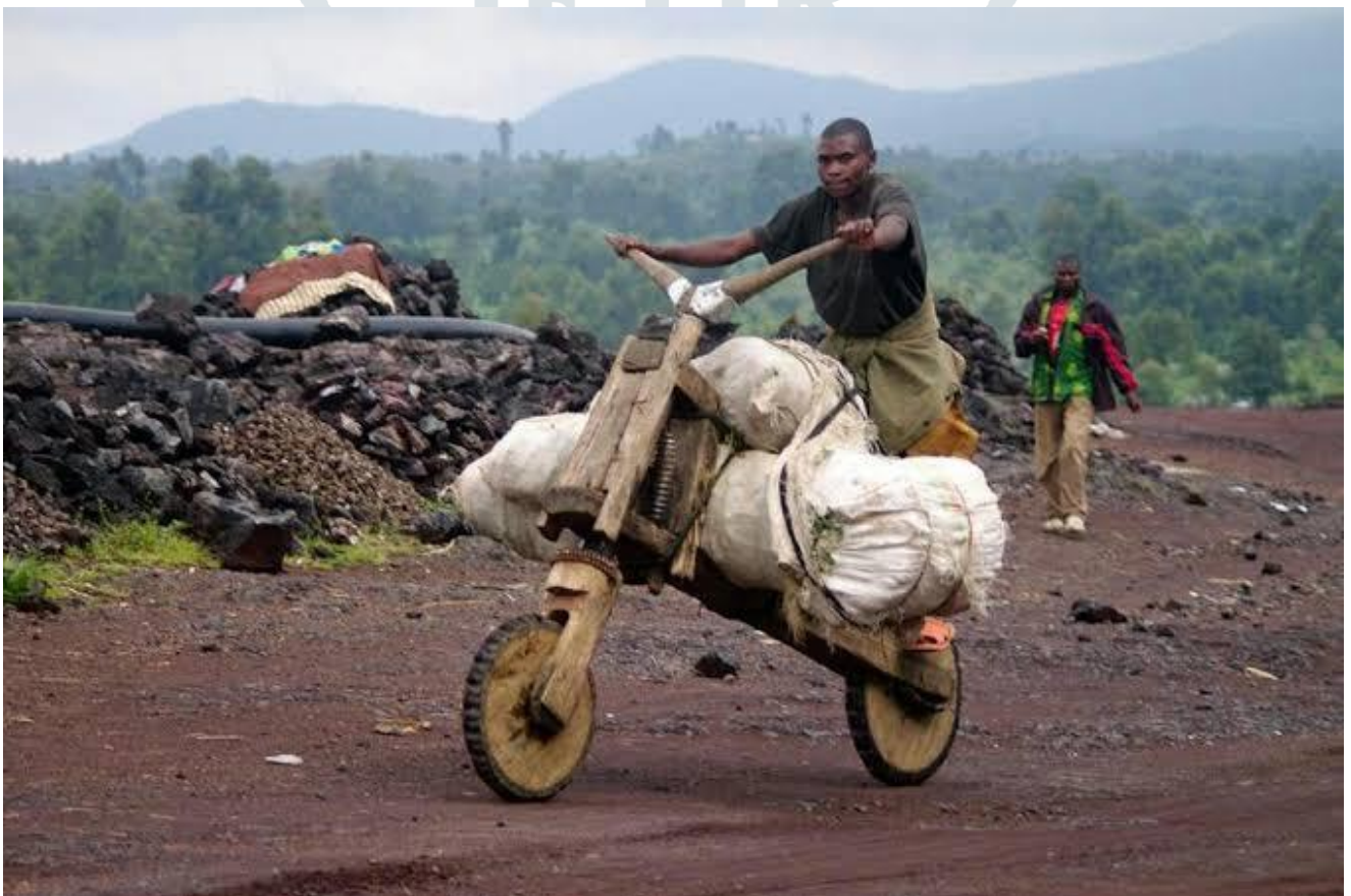
FIGURE. CHUKUDU (WOODEN SCOOTER)