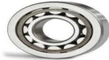
Fig6: Bearing no (SKF-6294)

A bearing is a device to permit constrained relative motion between two parts, typically rotation or linear movement. Bearings may be classified broadly according to the motions they allow and according to their principle of operation. Low friction bearings are often important for efficiency, to reduce wear and to facilitate high speeds. Essentially, a bearing can reduce friction by virtue of its shape, by its material, or by introducing and containing a fluid between surfaces. By shape, gains advantage usually by using spheres or rollers. By material, exploits the nature of the bearing material used. Sliding bearings, usually called bushes journal bearings, sleeve bearings, rifle bearings or plain bearings. Rolling-element bearings such as ball bearings and roller bearings are used for this purpose. In this project roller ball bearing such as bearing no: - (SKF-6294) is used for this purpose.