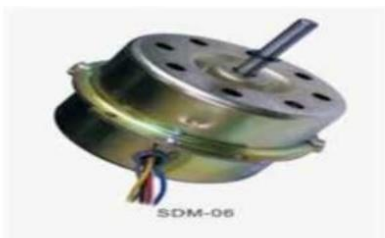
Fig : AC (alternating current) motor